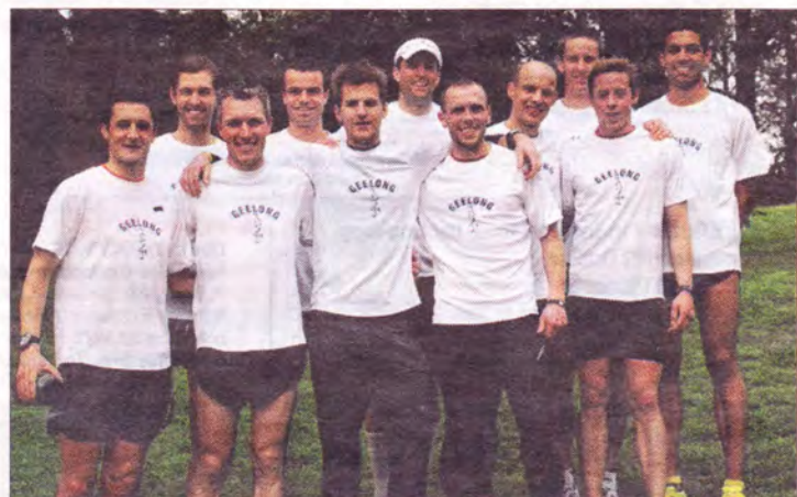
CHAMPIONS: The triumphant 2010 Geelong region team.

The over 40 men's side ended its season in style by winning a bronze medal.